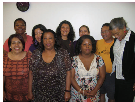
Some of the graduating students of the Faith-rooted Organizing Class of May 2009